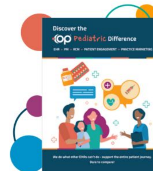
"OP Difference" Brochure