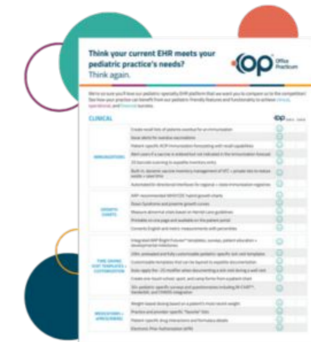
"Compare Us" Checklist