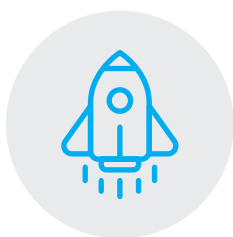
Full RCM Services

OP RCM is not one-size-fits-all. There are so many ways to partner with us!