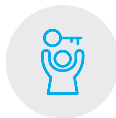
Credentialing & Enrollments